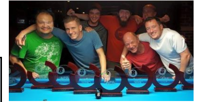
Str8 Banking WINNER