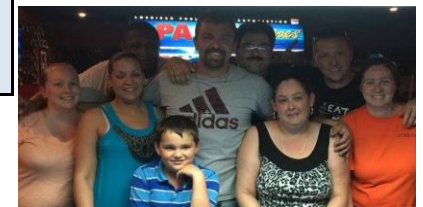
4 Hero's & 4 Zero's WINNER